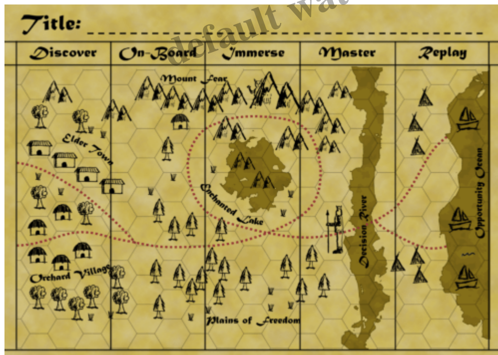
The Epic User Journey