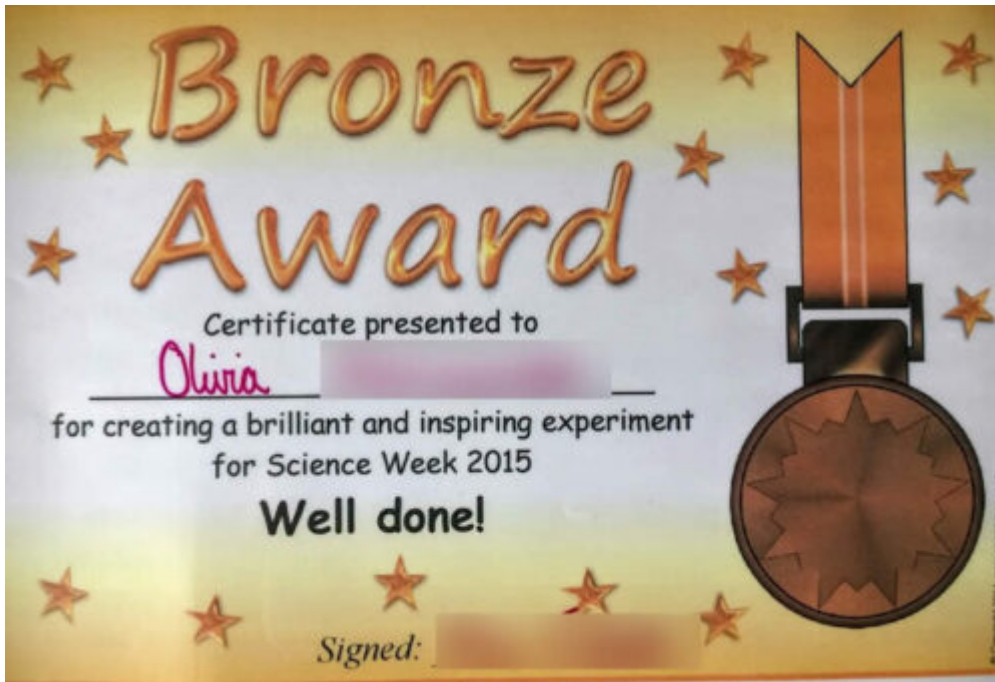
Bronze Award for Science Experiment

If you guessed the Gold award for reading 25 times or more in a term – you were wrong. She has half a dozen of them on the wall. The Bronze award for a “brilliant and inspiring” science experiment had her far more excited than all of the Gold awards put together.