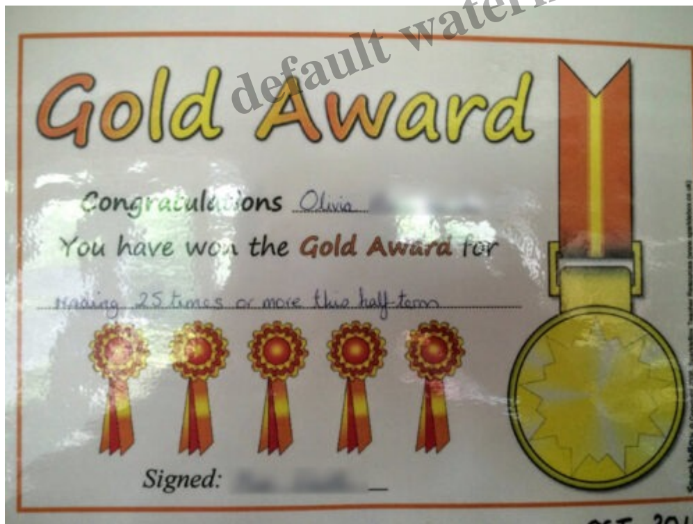
Gold Award for reading 25 times in a term

One of the things that my daughters school like to do is give certificates to students for various achievements. Below are two that she has had over the last few months. Which one do you think she was happiest to get?