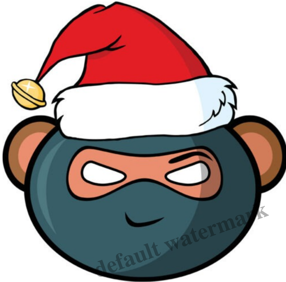
Christmas Ninja Monkey