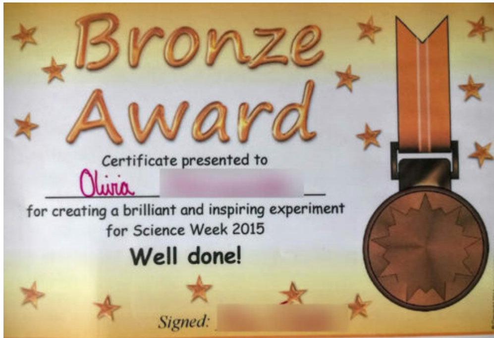
Bronze Award for Science Experiment

If you guessed the Gold award for reading 25 times or more in a term – you were wrong. She has half a dozen of them on the wall. The Bronze award for a “brilliant and inspiring” science experiment had her far more excited than all of the Gold awards put together.