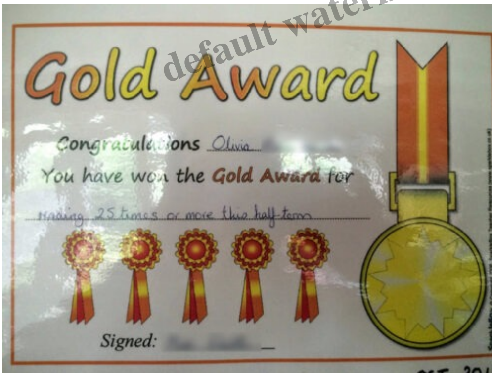
Gold Award for reading 25 times in a term

One of the things that my daughters school like to do is give certificates to students for various achievements. Below are two that she has had over the last few months. Which one do you think she was happiest to get?