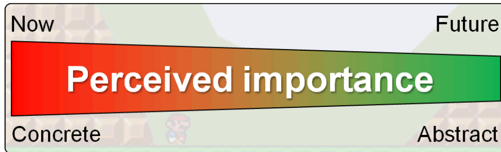
Construal Level Theory

Goals that are in the distance can be hard to focus on. I wrote a while ago about something called Construal Level Theory .