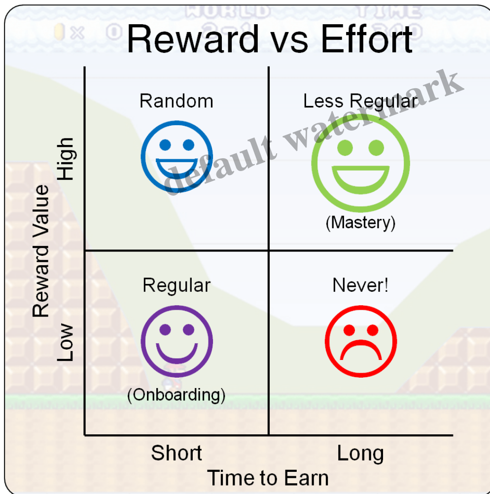
Reward Value vs Relative Effort and Delay

But, we need to be able to apply this in a reliable way. The diagram below gives a quick outline of how you can be done.