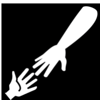
14 Signposting icon